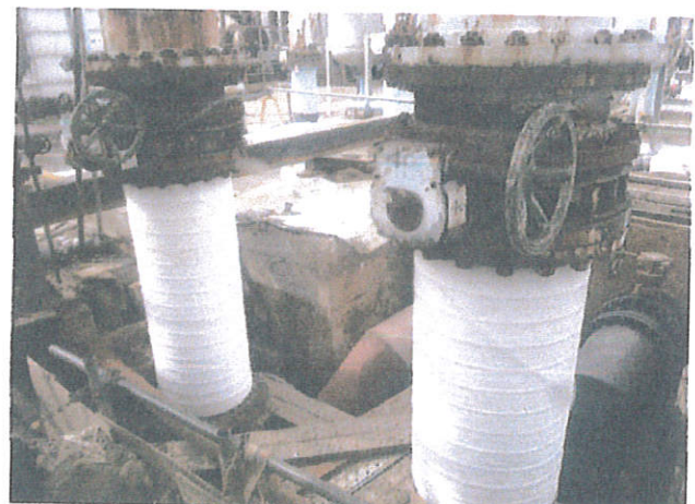
⑥ The contractor has done the same work for the 2nd pipe. The whole work finished.