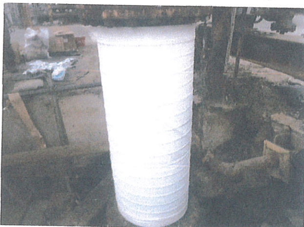
⑤ The MAGICAWRAP has been wrapped 1.5meter wide on the whole pipe. Thus, the work is done on the 1st pipe.