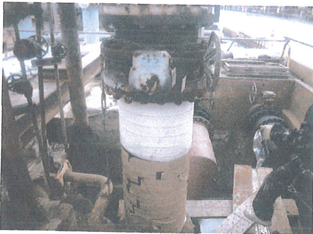
③ Next, wrap MAGICAWRAP for reinforcement & life extension of the pipe, and then spray or run water to squeeze gently the MAGICAWRAP in the same direction of wrapping. As training, the contractor applies the BUTYL ROLL in the same way.