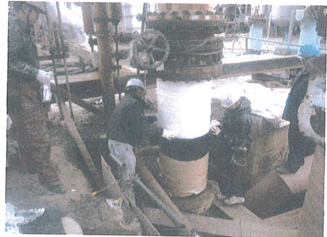
④ The MAGICAWRAP is wrapped by the contractor, too.